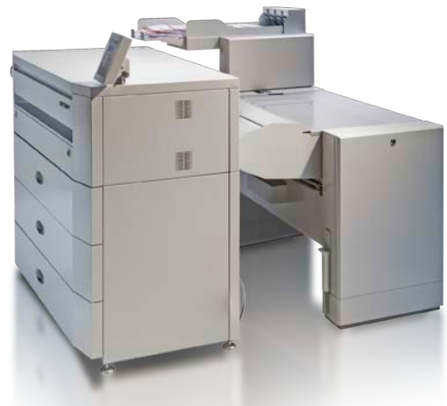
The on-line folder

Dimensions of input media: Max. width 960 mm, min. width 140 mm, max. length 6.000 mm, min. length 210 mm